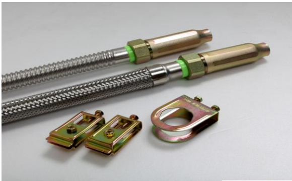
SPN-A XXX SPB-B XXX