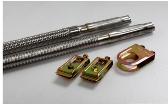
SPN-W XXX SPB-W XXX